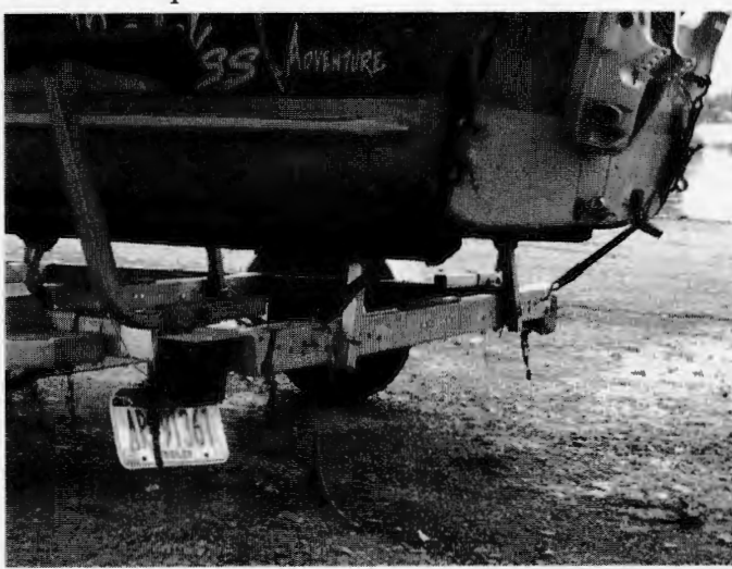
Eurasian watermilfoil hangs from a trailer leaving a lake.

Members of several NYSFOLA lake associations were on hand at a public meeting last October as officials from the Town of Harrietstown, in Franklin County, heard comments on a proposed local law that would help prevent the spread of aquatic invasive species in some Adirondack lakes. The law, which passed on a unanimous decision of the town board, requires boaters to remove all aquatic plants from their boats and trailers before entering or exiting any water body in the town including Lake Colby, Lake Clear, Upper, Middle and Lower Saranac Lakes, the St. Regis lakes, Kiwassa Lake and the Raquette River.