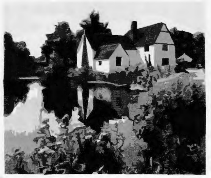
Maintaining natural vegetation around lakefront property is crucial to water quality and the biological health of lakes.

Reducing nutrient input and returning shorelines to a more natural state will greatly benefit all lakes. While there has been much focus on nutrients in the last several decades, shorelines have only recently begun to be a major focus of lake management. The NLA results show that degraded lakeshore habitat is the most significant stressor to poor biological integrity.